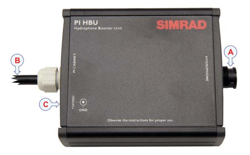
Figure 5 PI HBU (Hydrophone Booster Unit) connections